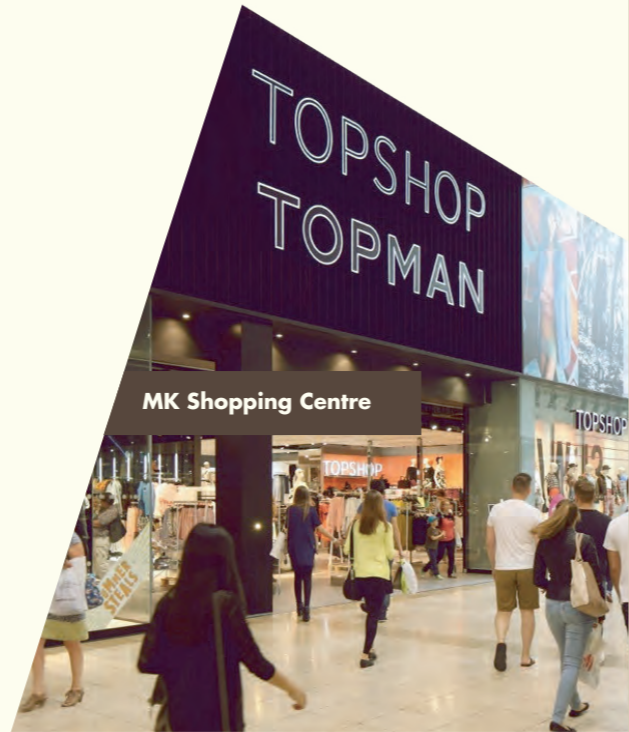
MK Shopping Centre