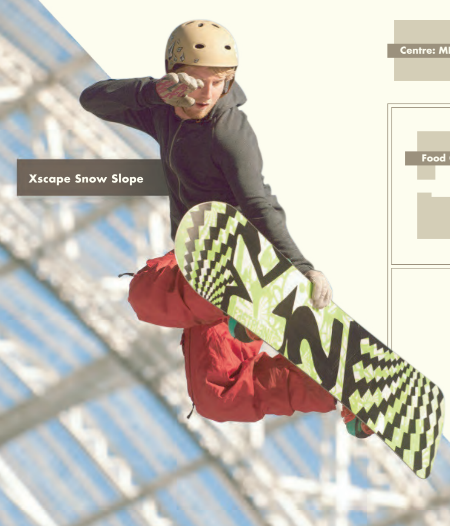
Xscape Snow Slope

The property is also right next to Milton Keynes 1,400 seat theatre that shows high volume West End shows. The adjacent theatre regularly attracts 12,000 customers a week .