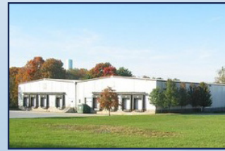
7 LAKE STATION ROAD Warwick, NY