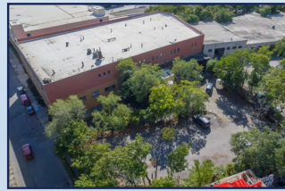
144 E KINGSBRIDGE ROAD Mount Vernon, NY