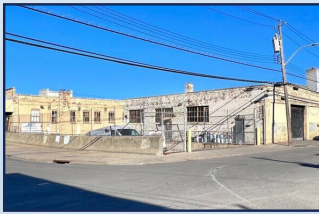
19 BABCOCK PLACE Yonkers, NY