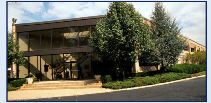
1 OLYMPIC DRIVE Orangeburg, NY