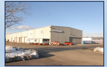
2618 ROUTE 302 Middletown, NY