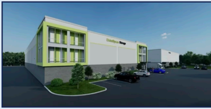
100 BUSINESS PARK DRIVE Armonk, NY