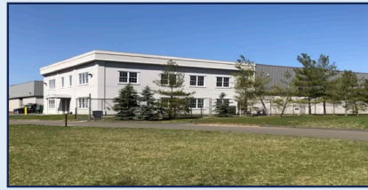
129 WOODWARD AVENUE Norwalk, CT